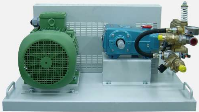
15CP59 59 LPM 100 BAR CAT PUMP 400 V 126 Kg OPTIONS: Control Box / On-Off Timer Pressure Switch / Autom. Drain