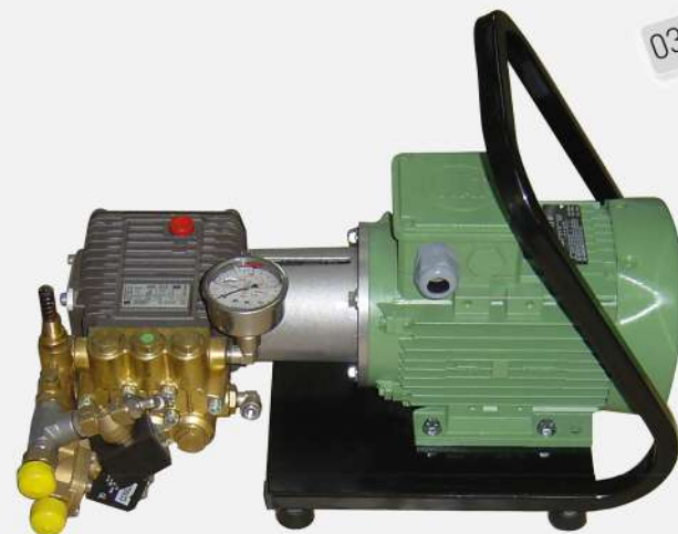
AJ12 12 LPM 120 BAR BERTOLINI PUMP 400 V 32 Kg OPTIONS: Control Box / On-Off Timer Pressure Switch / Autom. Drain