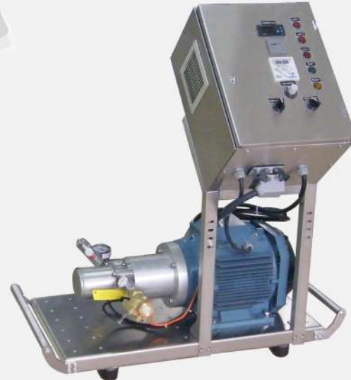
INVERTOR DFP12.5-10/27 10 TO 27 LPM 100 BAR DANFOSS PUMP 400 V 97 Kg ALL SS STEEL FRAME Control Box, On-Off timer, Pressure Switch, Automatic Drain