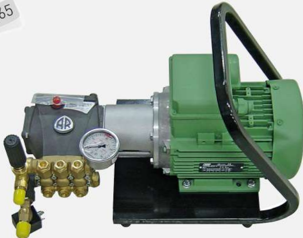
AR6-C 6 LPM 120 BAR A.R. PUMP 230 V 26 Kg OPTIONS: Control Box / On-Off Timer Pressure Switch / Autom. Drain