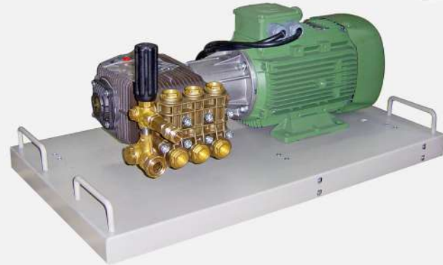
AR26 26 LPM 80/120 BAR A.R. PUMP 400 V 49 Kg OPTIONS: Control Box / On-Off Timer Pressure Switch / Autom. Drain