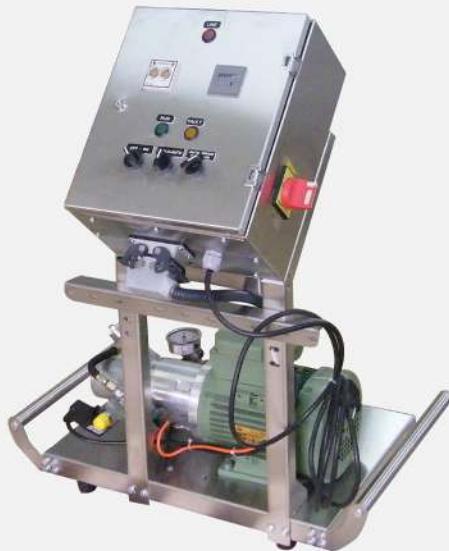
DFP4-5 5 LPM 100 BAR DANFOSS 230V XX Kg ALL SS FRAME Control Box, On-Off timer, Pressure Switch, Automatic Drain