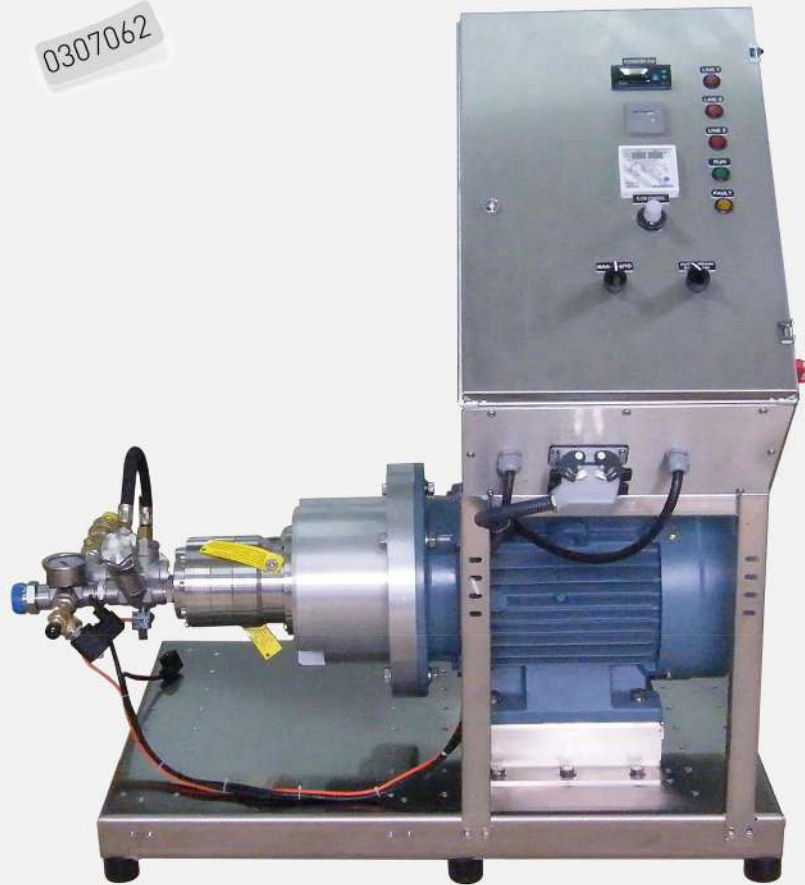
INVERTOR DFP32 29 TO 73 LPM DANFOSS PUMP 100 BAR 400 V 266 Kg ALL SS STEEL FRAME Control Box, On-Off timer, Pressure Switch, Automatic Drain