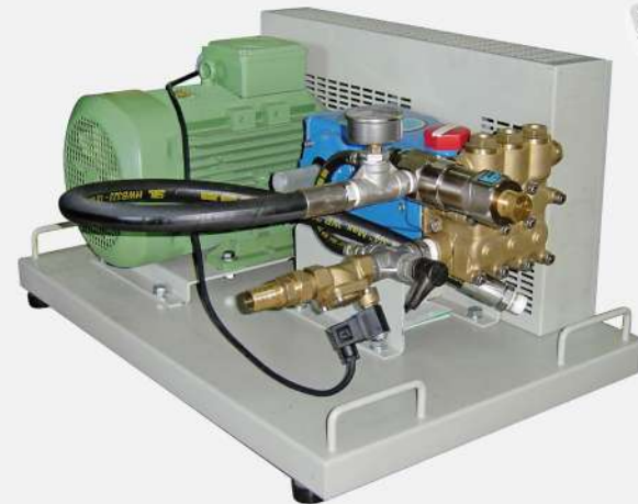
15CF68 68 LPM 80 BAR CAT PUMP 400 V 124 Kg OPTIONS: Control Box / On-Off Timer Pressure Switch / Autom. Drain