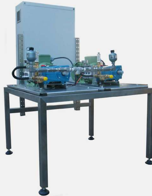
2 X 85 LPM CAT PUMPS. TOTAL FLOW 170 LPM