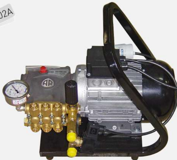
AR9 9 LPM 90 BAR A.R. PUMP 230 V 26 Kg OPTIONS: Control Box / On-Off Timer Pressure Switch / Autom. Drain