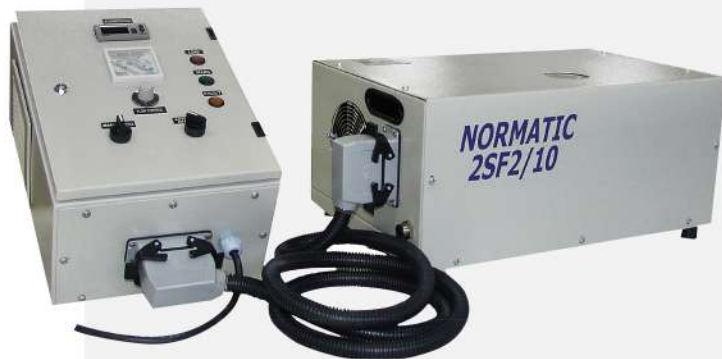
2SF 2-10 2 TO 10 LPM ADJUSTABLE BY INVERTER. 140 BAR CAT PUMP 400 V 52 Kg On-Off Timer, Control Box Pressure switch / Automatic Drain