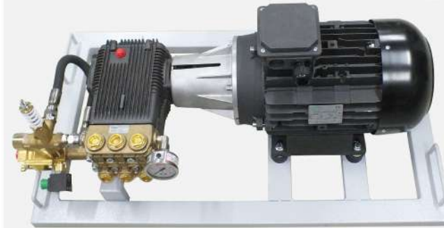
AR50 50 LPM 100 BAR A.R. PUMP 400 V 93 Kg OPTIONS: Control Box / On-Off Timer Pressure Switch / Autom. Drain