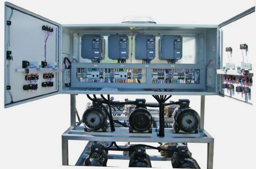
6 x 50 LPM ANNOVI REVERBERI PUMP STATION INVERTER CONTROLLED TOTAL FLOW 300 LPM