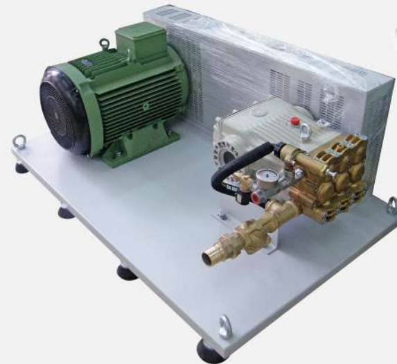
CX155 155 LPM 100 BAR BERTOLINI PUMP 400 V 486 Kg OPTIONS: Control Box / On-Off Timer Pressure Switch / Autom. Drain