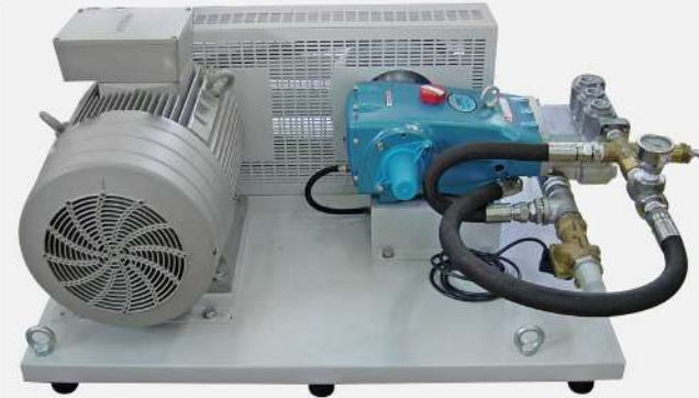
35CP170 170 LPM 70 BAR CAT PUM 400 V 170 LPM OPTIONS: Control Box / On-Off Timer Pressure Switch / Autom. Drain