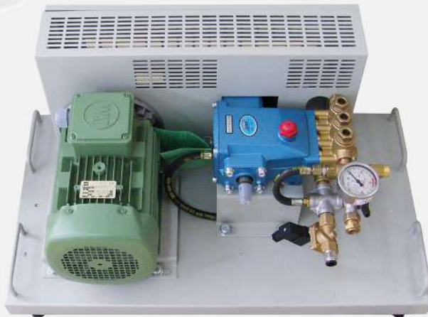
5CP23 23 LPM 135 BAR CAT PUMP 400V 63 Kg OPTIONS: Control Box / On-Off Timer Pressure Switch / Autom. Drain