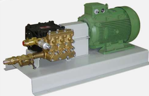
W100 100 LPM 100 BAR INTERPUMP PUMP 400 V 213 Kg OPTIONS: Control Box / On-Off Timer Pressure Switch / Autom. Drain