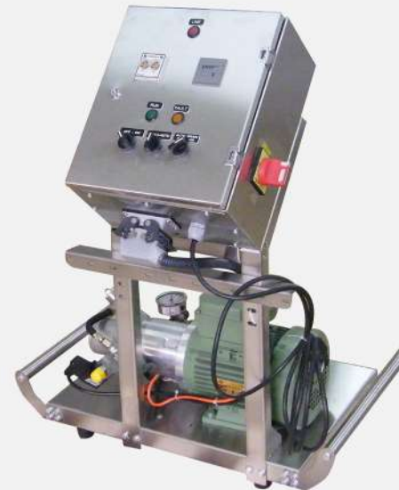
INVERTER DFP2-1/5 1 TO 5 LPM 100 BAR 230 V 41 Kg ALL SS FRAME Control Box, On-Off timer, Pressure Switch, Automatic Drain