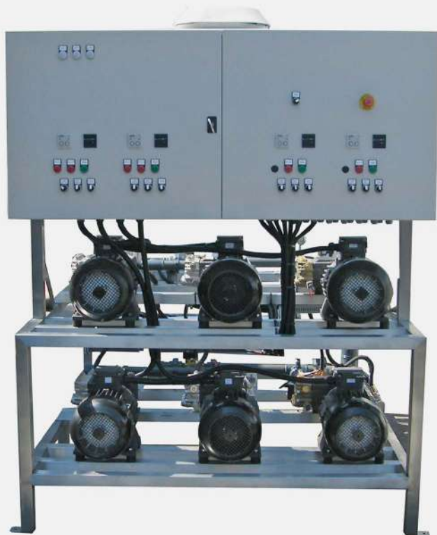
6 x 42 LPM ANNOVI REVERBERI PUMP STATION INVERTER CONTROLLED TOTAL FLOW 252 LPM