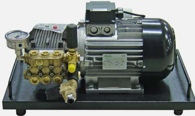
AR7 7 LPM 100 BAR A.R. PUMP 230 V 35 Kg OPTIONS: Control Box / On-Off Timer Pressure Switch / Autom. Drain