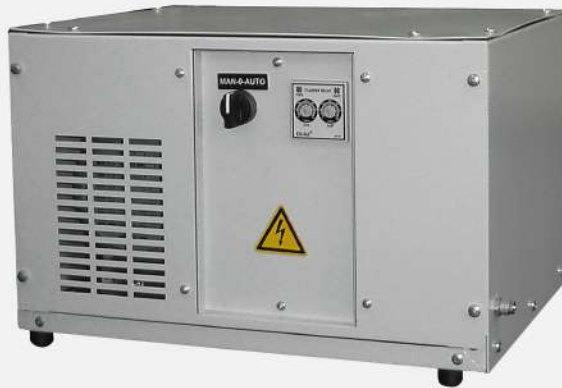
RR 0.5 - 1 - 2 - 3 - 4 LPM 70 BAR, TIMER, PRESSURE SWITCH AUTOMATIC DRAIN 3 PISTONS A.R PUMP 230 V 26/27/27/27/28 Kg