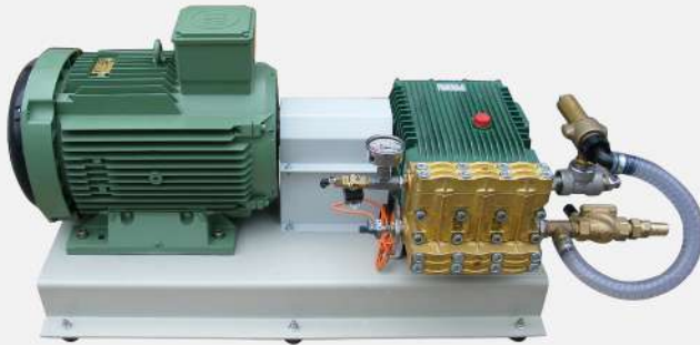
CK92 92 LPM 120 BAR BERTOLINI PUMP 400 V 230 Kg OPTIONS: Control Box / On-Off Timer Pressure Switch / Autom. Drain