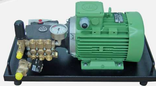
AR14 14 LPM 150 BAR A.R. PUMP 400V 31 Kg OPTIONS: Control Box / On-Off Timer Pressure Switch / Autom. Drain