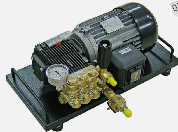
AR21 21 LPM 120 BAR A.R. PUMP 400 V 48 Kg OPTIONS: Control Box / On-Off Timer Pressure Switch / Autom. Drain