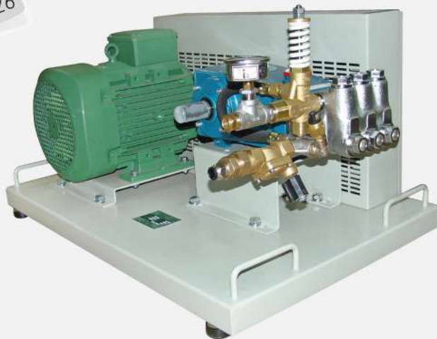
15CP45 45 LPM 125 BAR CAT PUMP 400 V 116 Kg OPTIONS: Control Box / On-Off Timer Pressure Switch / Autom. Drain