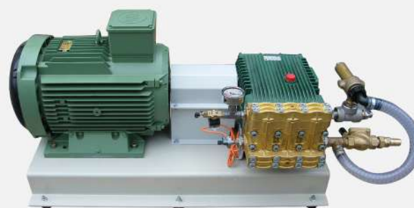
CK72 72 LPM 120 BAR BERTOLINI PUMP 400 V 196 Kg OPTIONS: Control Box / On-Off Timer Pressure Switch / Autom. Drain