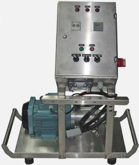
DFP6.3-8 8 LPM 100 BAR DANFOSS 230 V 54 Kg ALL SS FRAME Control Box, On-Off timer, Pressure Switch, Automatic Drain