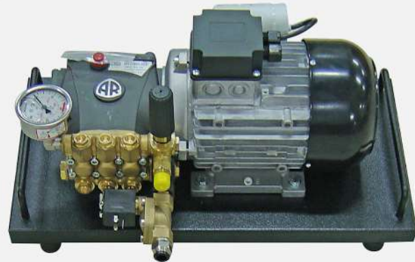
AR8-C 8 LPM 120 BAR A.R. PUMP 230 V 28 Kg OPTIONS: Control Box / On-Off Timer Pressure Switch / Autom. Drain