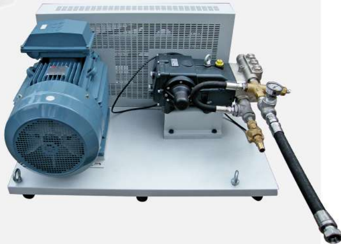
AR135 135 LPM 100 BAR A.R. PUMP 400 V 450 Kg Control Box / On-Off Timer Pressure Switch / Autom. Drain