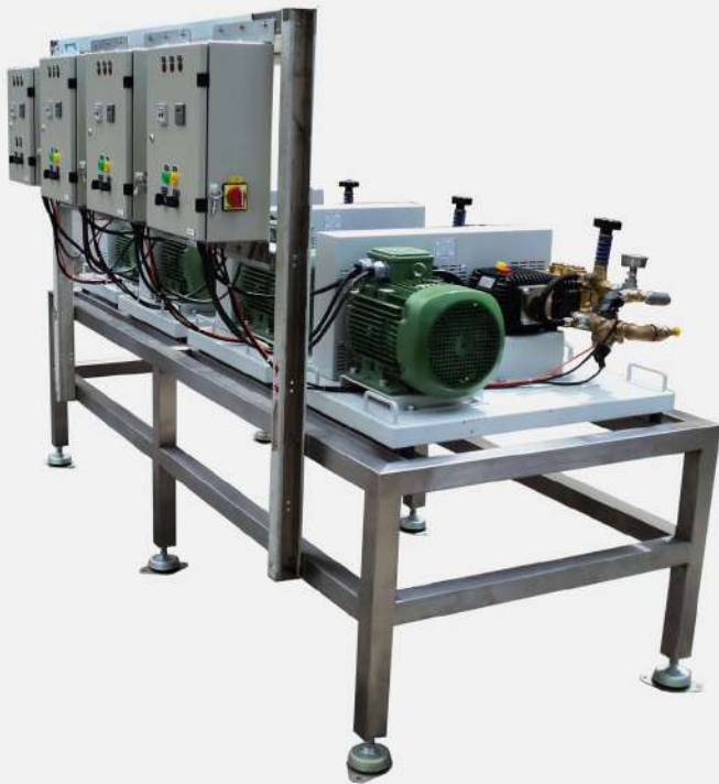
4 x 50 LPM BERTOLINI PUMPS. TOTAL FLOW 200 LPM