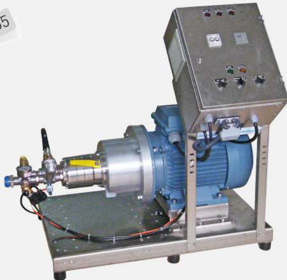
DFP32-45 45 LPM 100 BAR DANFOSS 400 V 215 Kg ALL SS FRAME Control Box, On-Off timer, Pressure Switch, Automatic Drain