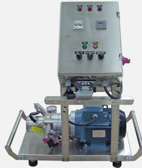
DFP-10-13 13LPM 100 BAR DANFOSS 400V 61 Kg ALL SS FRAME Control Box, On-Off timer, Pressure Switch, Automatic Drain