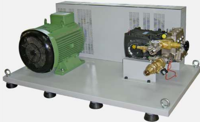
KF153 153 LPM 130 BAR INTERPUMP 400 V 470 Kg OPTIONS: Control Box / On-Off Timer Pressure Switch / Autom. Drain