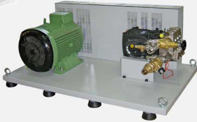
KF170 170 LPM 120 BAR INTERPUMP 400 V 470 Kg OPTIONS: Control Box / On-Off Timer Pressure Switch / Autom. Drain