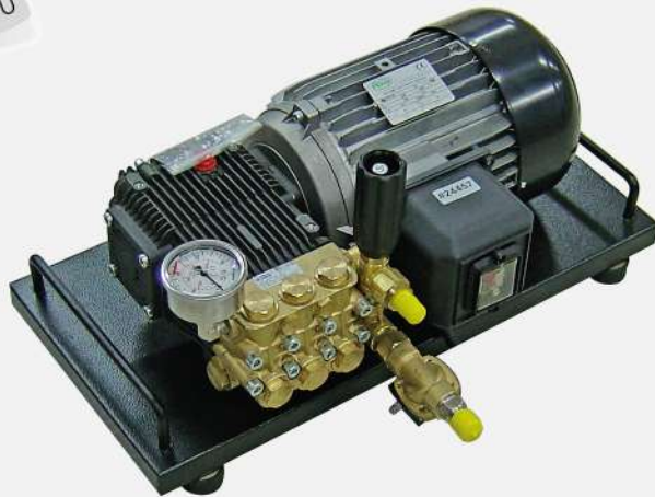
AR15 15 LPM 120 BAR A.R. PUMP 400 V 39 Kg OPTIONS: Control Box / On-Off Timer Pressure Switch / Autom. Drain