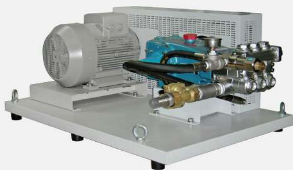
35CP87 87 LPM 140 BAR CAT PUMP 400 V 235 Kg OPTIONS: Control Box / On-Off Timer Pressure Switch / Autom. Drain