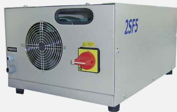
2SF5 5 LPM 140 BAR CAT PUMP 230 V 39 Kg OPTIONS: Control Box / On-Off Timer Pressure Switch / Autom. Drain