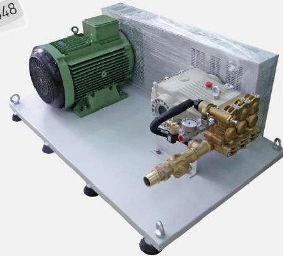
CX175 175 LPM 100 BAR BERTOLINI PUMP 400 V 486 Kg OPTIONS: Control Box / On-Off Timer Pressure Switch / Autom. Drain