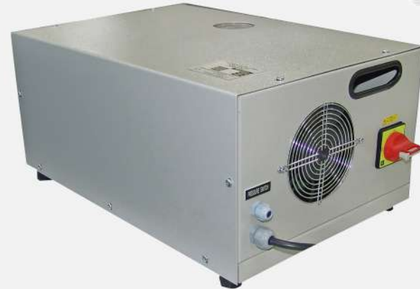
2SF10 10 LPM 140 BAR CAT PUMP 400 V 42 Kg OPTIONS: Control Box / On-Off Timer Pressure Switch / Autom. Drain