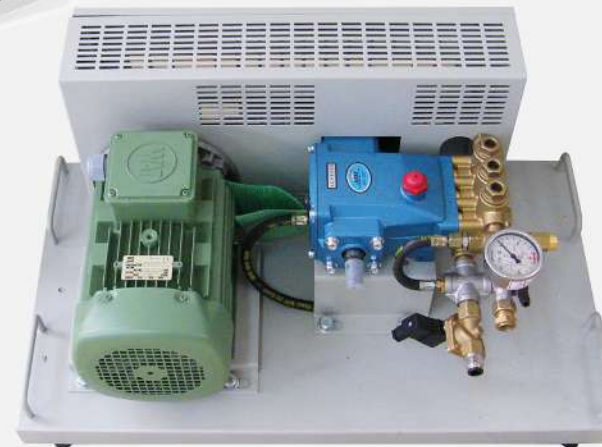
3CP16 16 LPM 155 BAR CAT PUMP 400 V 45 Kg OPTIONS: Control Box / On-Off Timer Pressure Switch / Autom. Drain