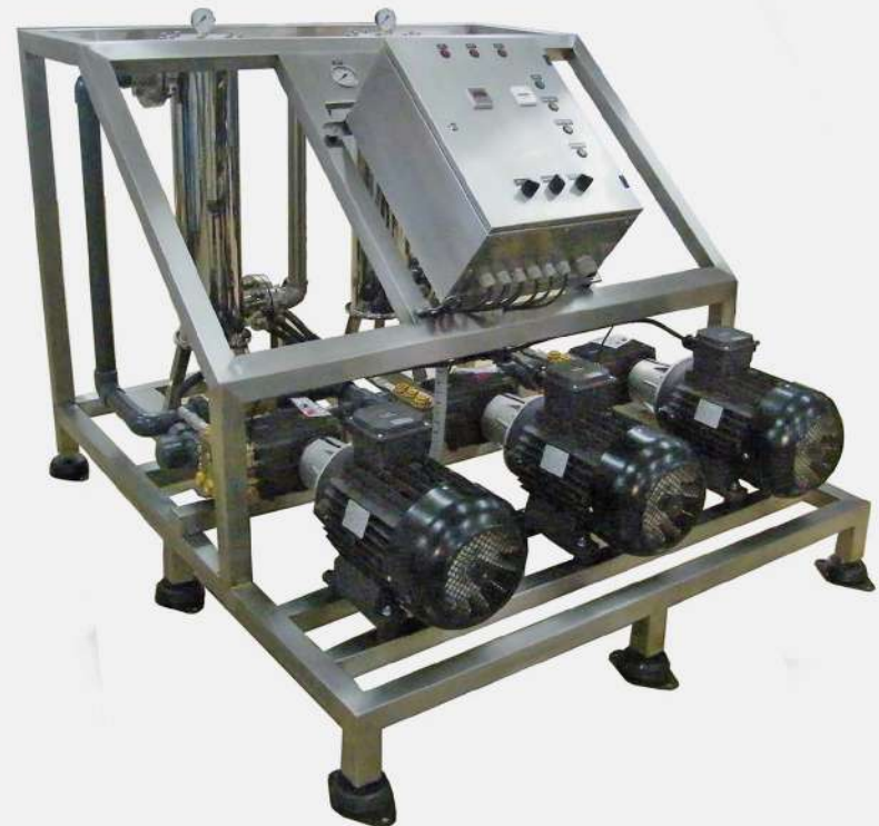
3 x 50 LPM ANNOVI REVERBERI PUMP STATION INVERTER CONTROLLED TOTAL FLOW 150 LPM