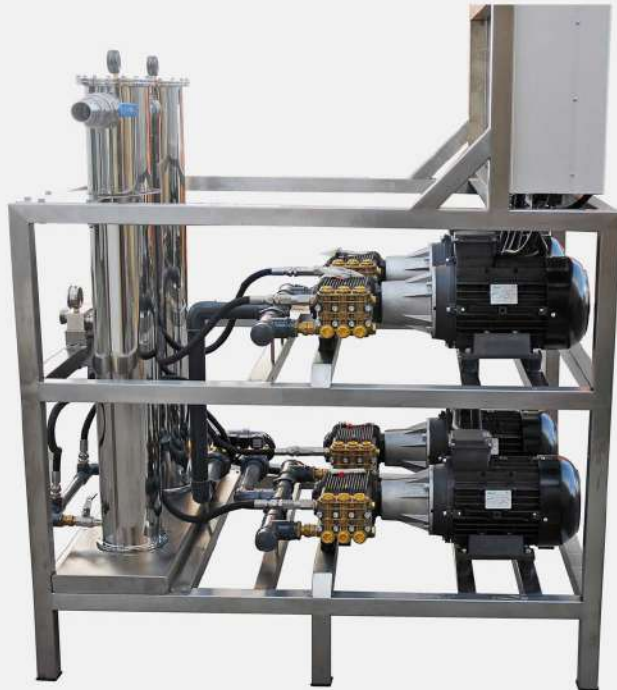
4 x 50 LPM ANNOVI REVERBERI PUMP STATION INVERTER CONTROLLED TOTAL FLOW 200 LPM