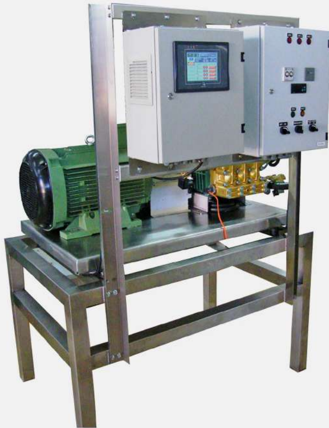
1 x 95 LPM BERTOLINI PUMP STATION INVERTER CONTROLLED TOTAL FLOW 95 LPM