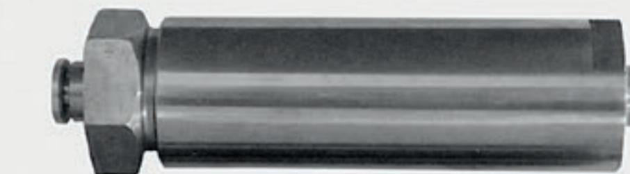
3/16" Slip-lok connection