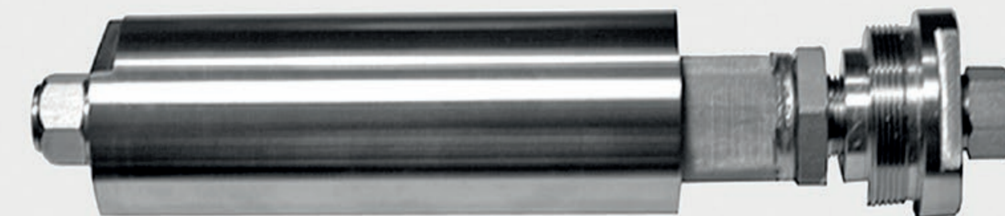
1/2" Slip-lok connection