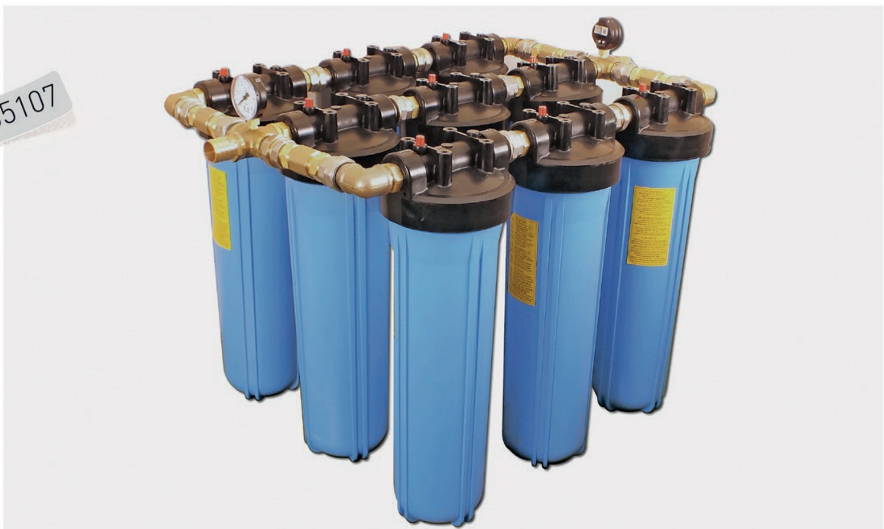
20" Jumbo 3x3 filter unit

1 1/4" Water inlet and outlet 5-10 and 20 Microns Max working pressure 6 bar Max flow 210 liters per minute Total of 9 filter bowl