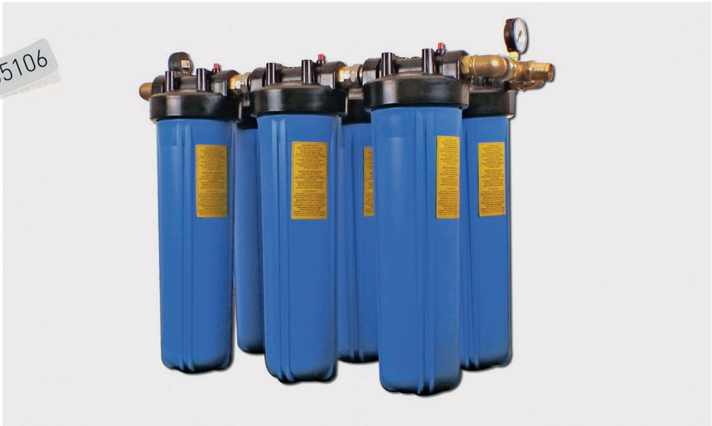
20" Jumbo 3x2 filter unit

1 1/4" Water inlet and outlet 5-10 and 20 Microns Max working pressure 6 bar Max flow 140 liters per minute